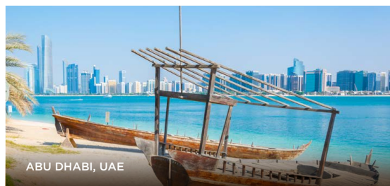
ABU DHABI, UAE