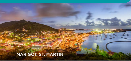
MARIGOT, ST. MARTIN